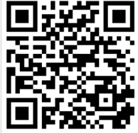
Gifts for a King

AS WE CONSIDER YEAR-END GIVING to the annual budget, as well as to the RENEW campaign, our pastors have made available a five-day devotional resource, “Gifts for a King,” examining generosity to Jesus. Please prayerfully consider how God would have you steward your resources. We have a limited number of print copies of this booklet from the PCA Foundation available in the Narthex and fellowship hall lobby; it is also available electronically using this QR code.