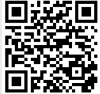
Gifts for a King

AS WE CONSIDER YEAR-END GIVING to the annual budget, as well as to the RENEW campaign, our pastors have made available a five-day devotional resource, “Gifts for a King,” examining generosity to Jesus. Please prayerfully consider how God would have you steward your resources. We have a limited number of print copies of this booklet from the PCA Foundation available in the Narthex and fellowship hall lobby; it is also available electronically using this QR code.