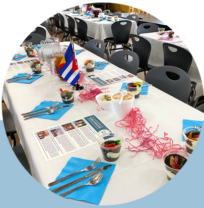
“BY ALL MEANS” MISSIONS CONFERENCE MARCH 15-19