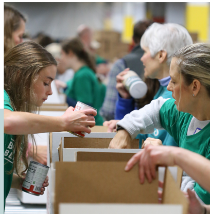
BOXES OF BLESSING