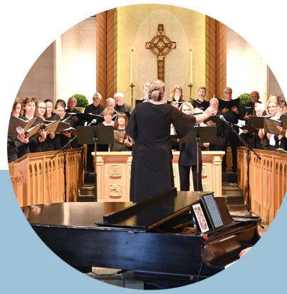
“SCRIPTURE AND SONG” SPRING CHOIR CONCERT MAY 7