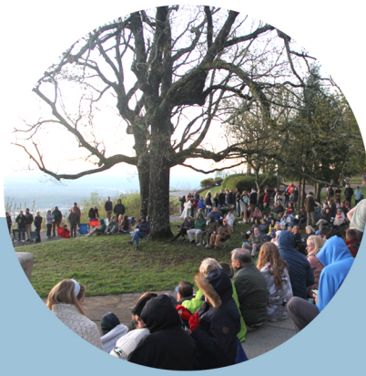
EASTER SUNRISE SERVICE AT POINT PARK APRIL 9