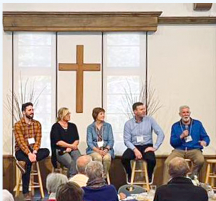
WORLD MISSIONS CONFERENCE 2023 "BY ALL MEANS"