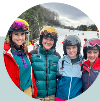
HIGH SCHOOL SALT & LIGHT RETREAT