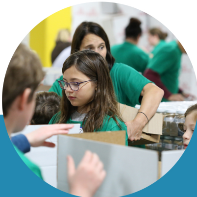
BOXES OF BLESSING (OVER 5,000 BOXES) DECEMBER 2