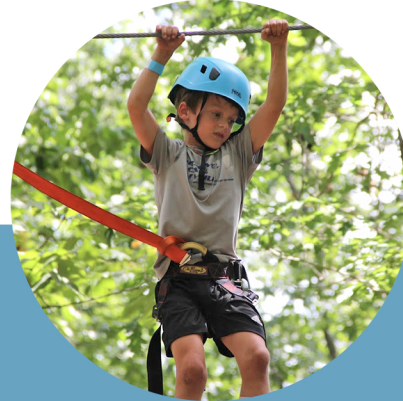
LMPC FAMILY CAMP AT CAMP ALPINE SEPTEMBER 9