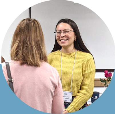
MINISTRY FAIR AUGUST 13