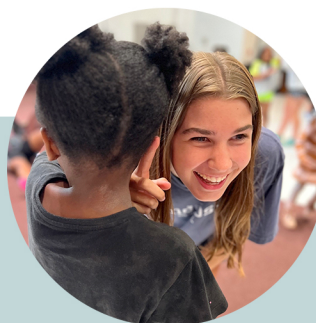
HIGH SCHOOL MISSIONS WEEK