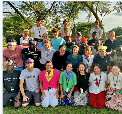
HIGH SCHOOL MISSIONS TRIP TO UGANDA