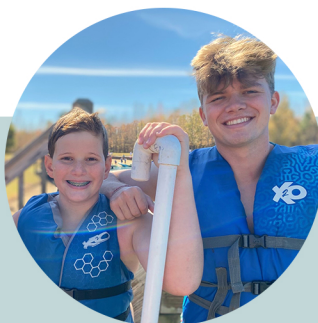
MIDDLE SCHOOL FALL RETREAT