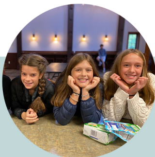
MIDDLE SCHOOL GREEN BEAN GAME