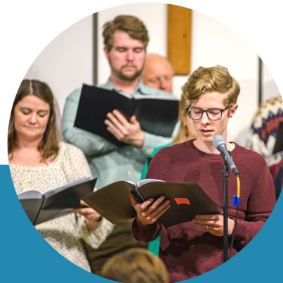
CHRISTMAS HYMN SING DECEMBER 3