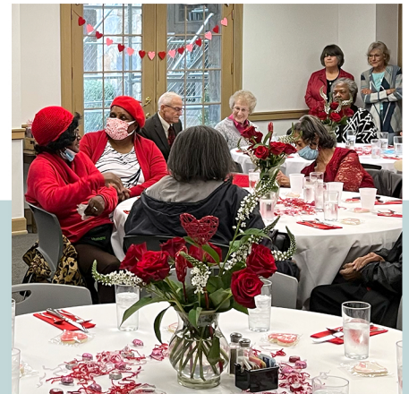
WIDOWS HARVEST VALENTINE'S EVENT