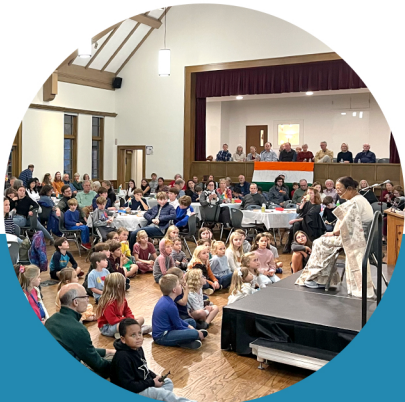
FAMILY-FRIENDLY MISSIONS REPORT NOVEMBER 12