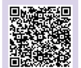
“Sweet Little Jesus Boy” West Coast Mennonite Chamber Choir