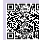
“In a Land by Death O’ershadowed” The Porter’s Gate