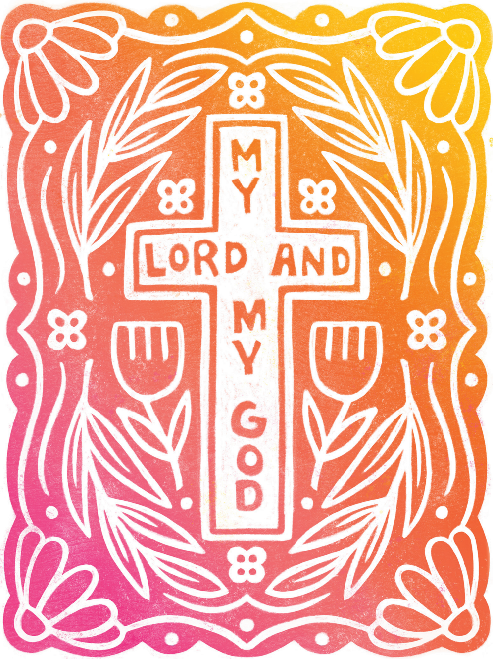
Fellowship Hall Easter Service