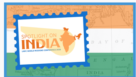
World Missions Conference