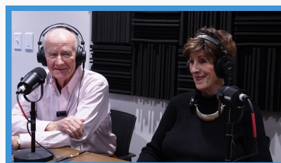
Pillar & Ground podcast